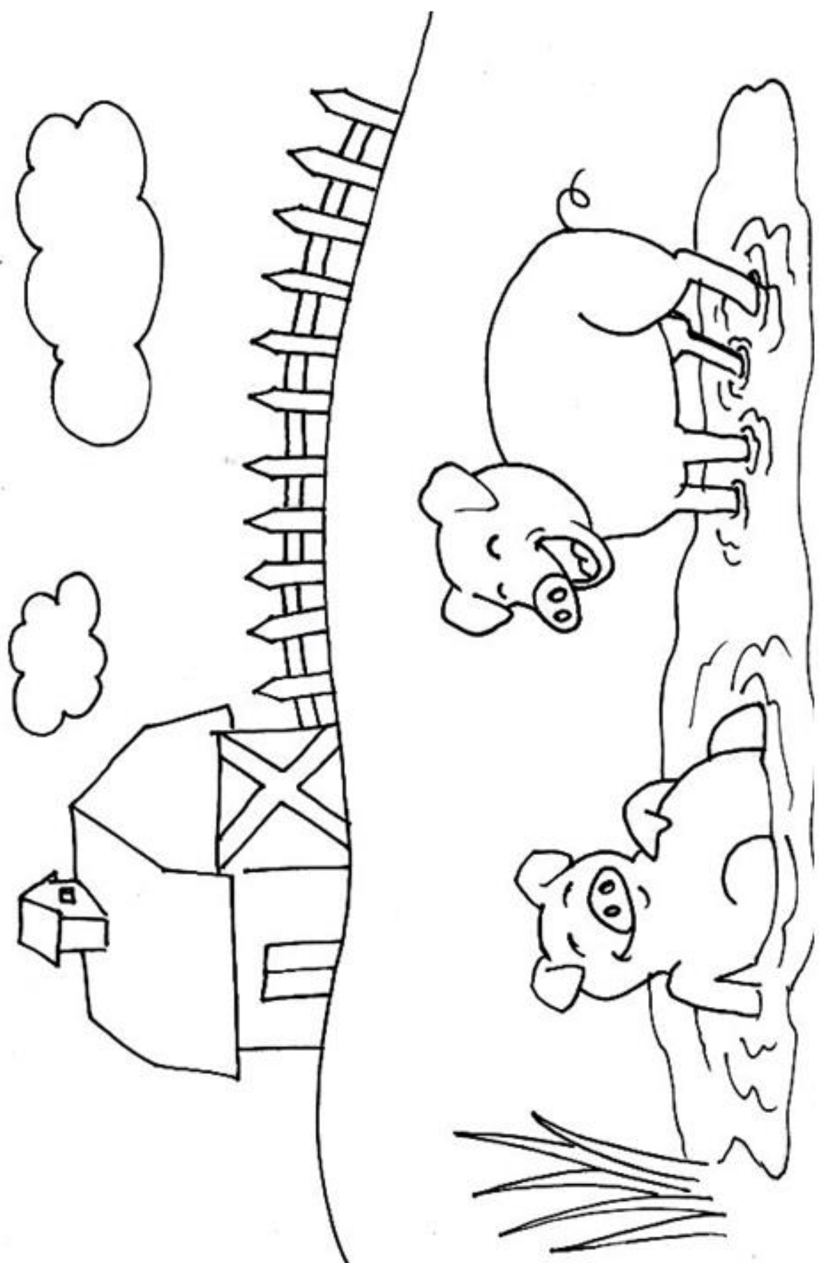
Pigs in Mud